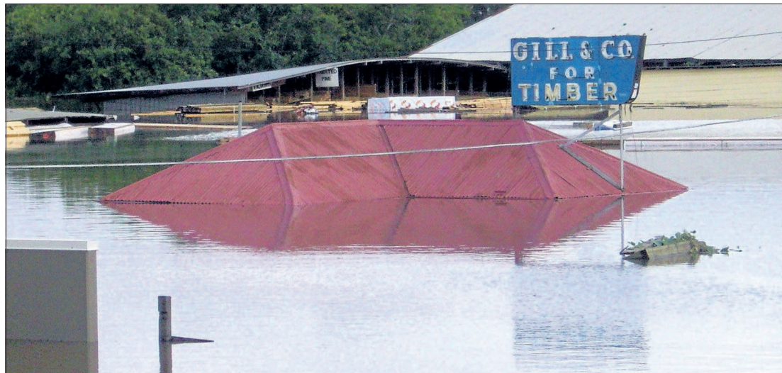
TOUGH TIMES: In 2011 Gill and Co faced a setback with the Brisbane floods. The Rocklea site was completely destroyed and had to be rebuilt.